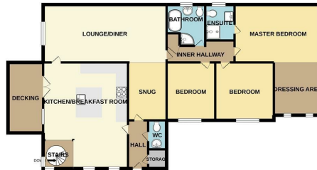
TOTAL FLOOR AREA: 1917 sq.ft. (178.1 sq.m.) approx. While every attempt has been made to ensure the accuracy of the floorplan contained herein, measurements of doors, windows, rooms and any other items are approximate and no responsibility is taken for any error, omission or mis-measurement. This plan is for illustrative purposes only and should be used as such by any prospective purchaser. The services, systems and appliances shown have not been tested and no guarantee is given as to their operability or efficiency can be given. Made with Metapix 03/2021