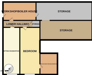
BASEMENT LEVEL 748 sq.ft. (69.5 sq.m.) approx.